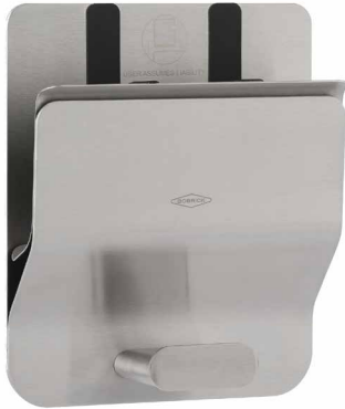
Patented, Patent Pending